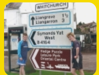
Checking the route home: Boys from Monmouth school on a sponsored run