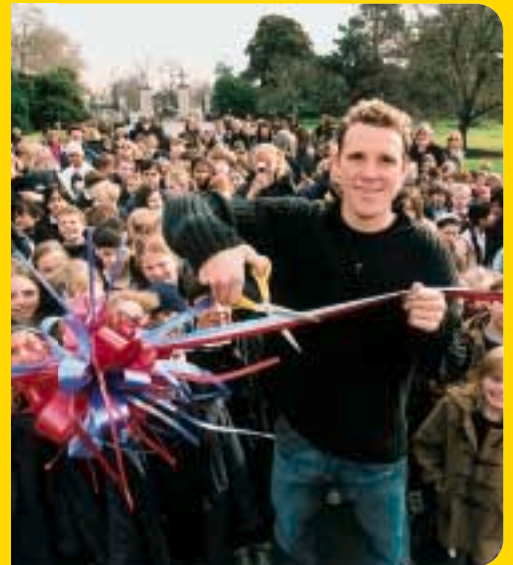
James Cracknell cutting the starting ribbon for our sponsored walk at Kew Gardens

OLYMPIC GOLD MEDALLIST James Cracknell and Rugby Union World Cup champion Lawrence Dallaglio, have so far helped React to raise more than £4,000. The sporting heroes joined us in a day of fundraising events at the Royal Botanic Gardens in Kew starting with a sponsored walk from the famous Nash conservatory. More than 800 local school children joined in the fun too. See inside for more details.